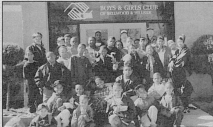
Bellwood: (left photo) Enthusiastic members of the Boys & Girls Club volunteered for the cleanup.

Good News! Batavia Spur Bridge Is Now Under Construction! ...see page 2